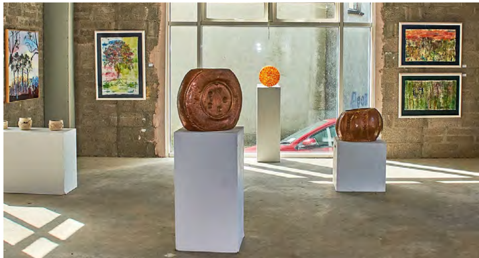
West Cork Creates