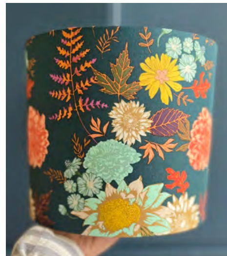
Mr Kite Designs

Contact mrkitedesigns@gmail.com for more information.