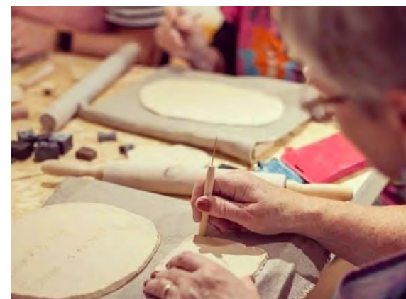
Porcelain Masterpiece, Orla O Visual