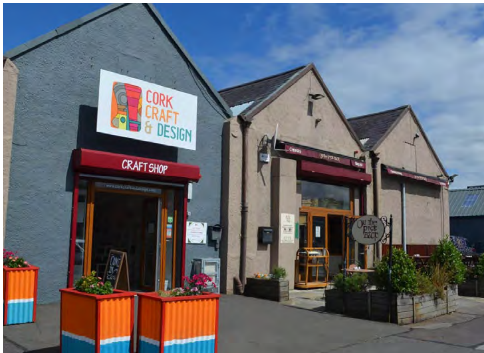
Cork Craft & Design Shop

discover beautifully made craft objects. Here, you can find many delights from wood, ceramics, glass, textiles, jewellery, soaps, handbound books and more - all made in Cork. Our shop is staffed by our members so pop in and say hello to meet our makers!