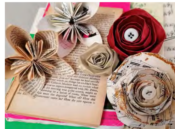
Zoom Paper Flowers