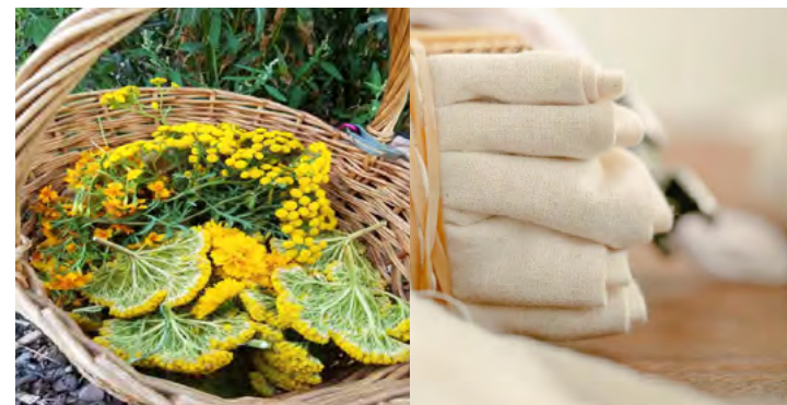
"The Fibre of Our Being" Exhibition